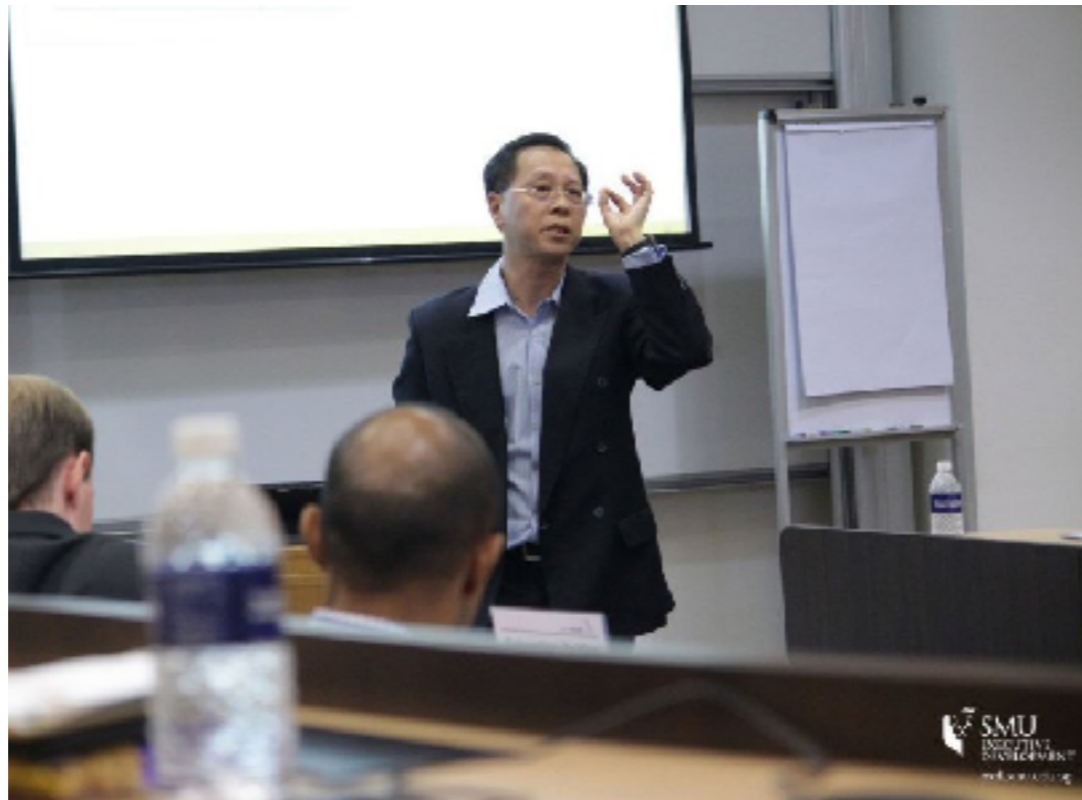
RETAIL BANKING: 45 STUDENTS 2ND APRIL, 8:15AM