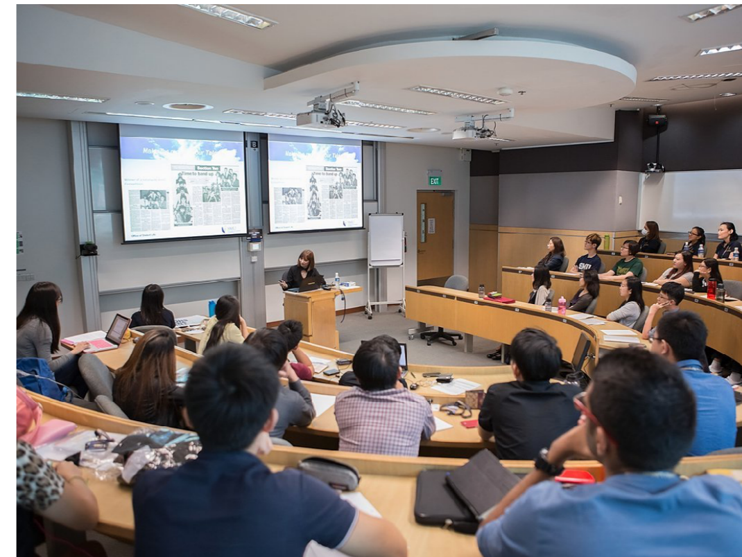
MASTER OF IT IN BUSINESS (MITB) 29 MARCH, 7PM

To determine and prove relevance of tBuddy across all education levels This is through collecting feedback from both students & educators (not just results).